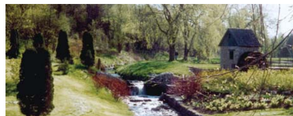
Churchill Park, Cambridge