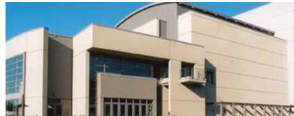
River Run Centre, Guelph