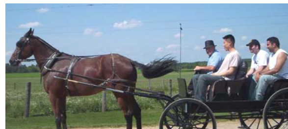
McMaster Students on a Buggy Ride