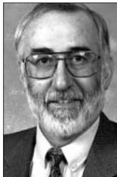
Dr. David Sackett

While at McMaster, Sackett developed and