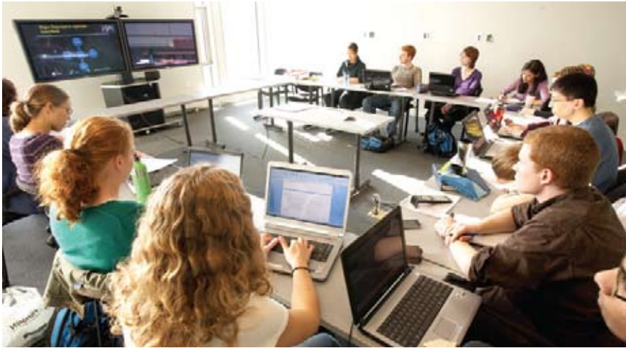
■ Medical students at the Waterloo Regional Campus connect with their classmates at the Hamilton and Niagara campuses during a videoconference session.

campus. The new building will house the medical school on the ground floor and Brock researchers and programs on the top two floors. The move is expected to take place in 2011.