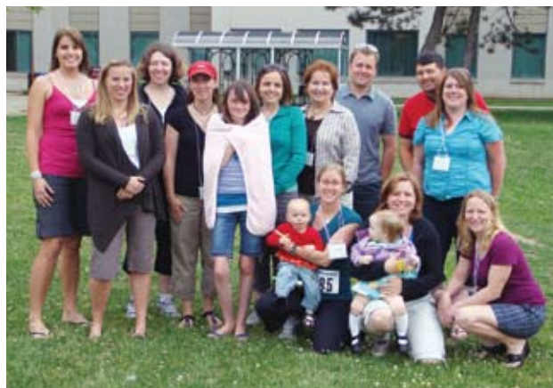
■ The School of Rehabilitation Science welcomed back the classes of '94, '99 and '04 for reunion events in June.