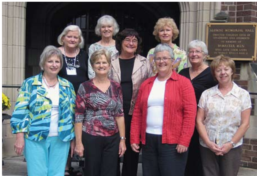
■ The nursing class of '67 returned to campus in September for a reunion luncheon.

Faculty of Health Sciences alumni returned to campus to reconnect with former classmates during reunion celebrations held in the summer and fall.